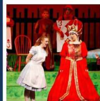
Drama and Dance