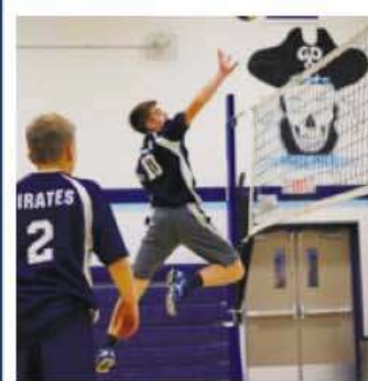
Team-work & Collaboration