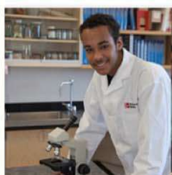
Medical Professional Program