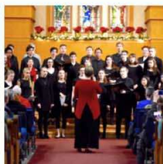
Superior Music and Choral Programs

Daniel McIntyre Collegiate Institute is located in a family oriented, multi-cultural community, close to many restaurants and Winnipeg's busy business district.