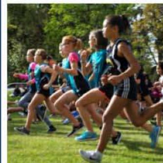
Clubs and Athletics