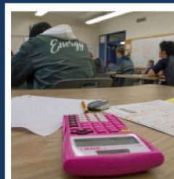
High School Diploma Program