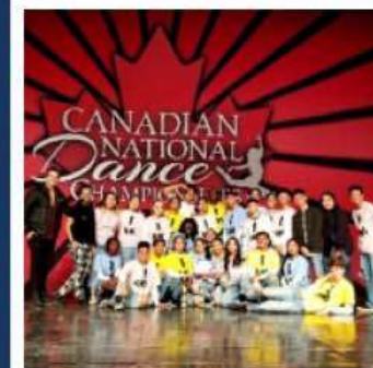
Competitive Dance & Hip Hop