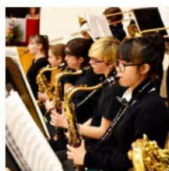
Multiple Music Programs