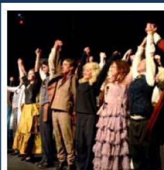
Performing Arts Certificate