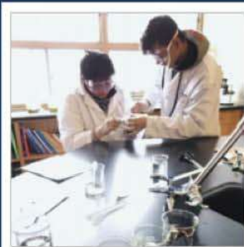
Regular Academic Program

Gordon Bell High School is located in the heart of Winnipeg, close to the downtown business and government buildings, and steps away from the University of Winnipeg's downtown campus.