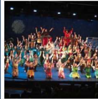
Semi-annual Musical Productions