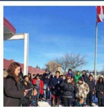
Social Justice Focus

Grant Park High School is located close to many shops and services, as well as Pan Am Pool, an Olympic-sized aquatic facility with many athletic programs and services.