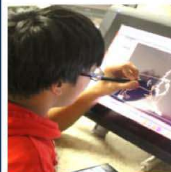
Graphic Arts and Multi Media