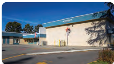
MCCLOSKEY ELEMENTARY School Population: 350