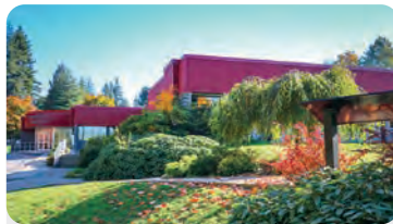
COUGAR CANYON ELEMENTARY School Population: 500