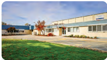
CHALMERS ELEMENTARY School Population: 475