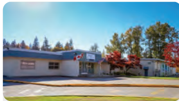
HEATH ELEMENTARY School Population: 225