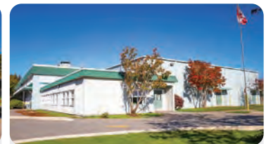
CLIFF DRIVE ELEMENTARY School Population: 300