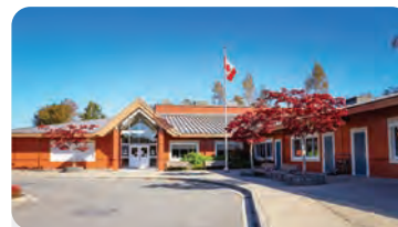
NEILSON GROVE ELEMENTARY School Population: 175