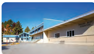
ENGLISH BLUFF ELEMENTARY School Population: 200