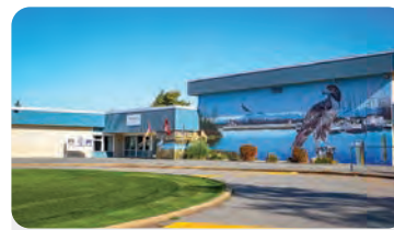
HAWTHORNE ELEMENTARY School Population: 450