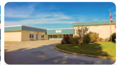
HOLLY ELEMENTARY School Population: 350