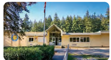
SUNSHINE HILLS ELEMENTARY School Population: 500