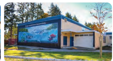
SOUTH PARK ELEMENTARY School Population: 400