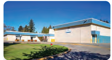
JARVIS ELEMENTARY School Population: 450