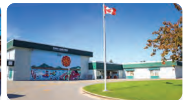
PORT GUICHON ELEMENTARY School Population: 175