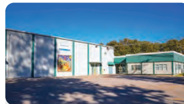
BEACH GROVE ELEMENTARY School Population: 300