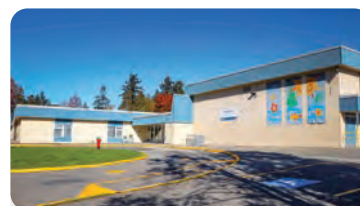
PEBBLE HILL ELEMENTARY School Population: 250