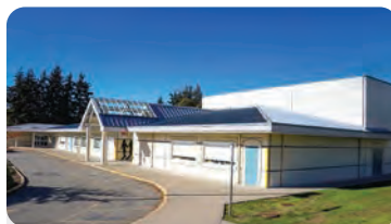
RICHARDSON ELEMENTARY School Population: 400