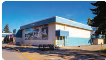
HELLINGS ELEMENTARY School Population: 300