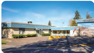
GRAY ELEMENTARY School Population: 500