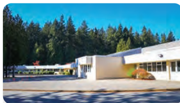
PINEWOOD ELEMENTARY School Population: 300