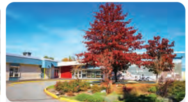
GIBSON ELEMENTARY School Population: 400