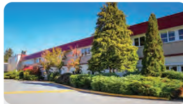
DEVON GARDENS ELEMENTARY School Population: 350