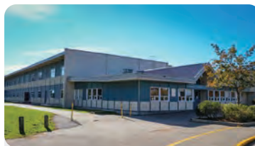
LADNER ELEMENTARY School Population: 450