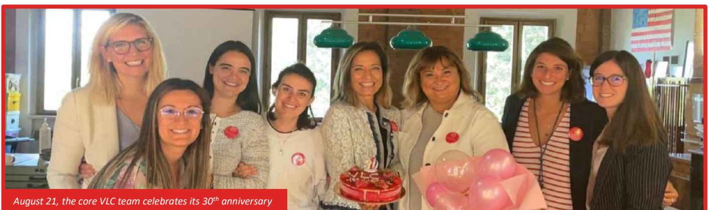
August 21, the core VLC team celebrates its 30 th anniversary

Launch of the Outbound program through Ayusa Global Youth Exchange, starting in USA, then expanding to Australia, New Zealand, Canada, Ireland, UK, Germany and France